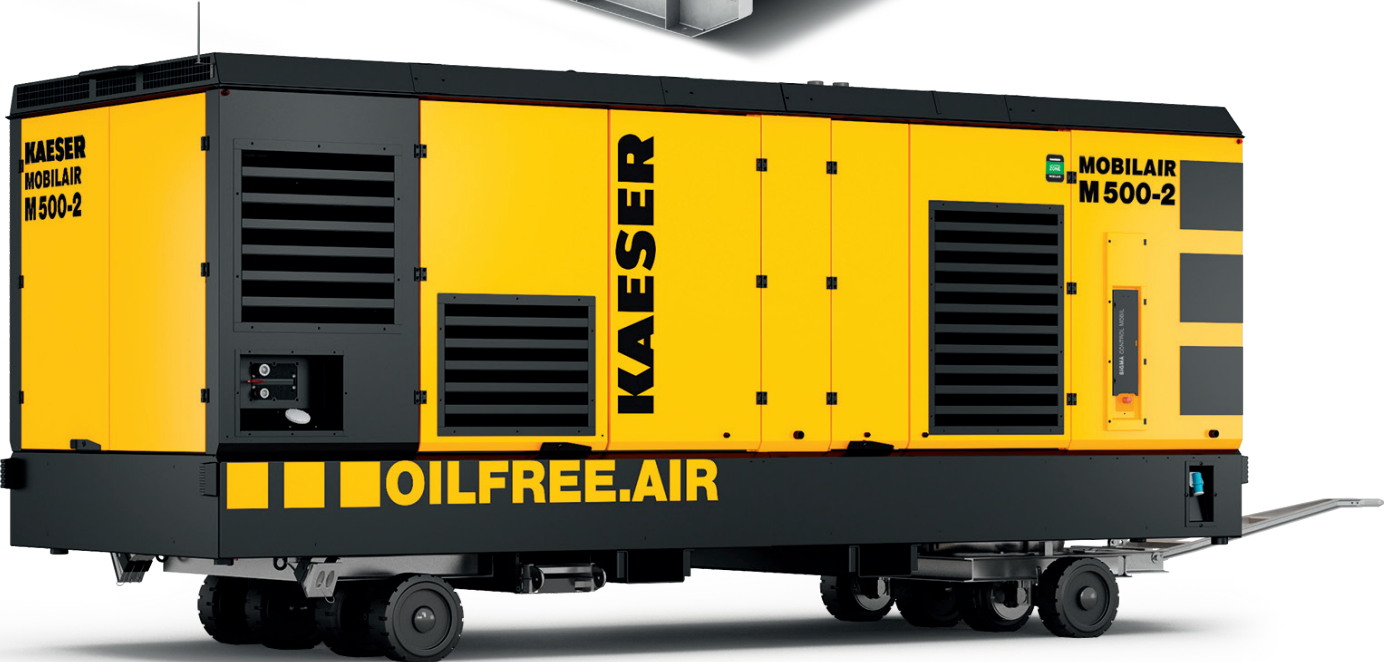
M500-2 diesel powered oil-free delivers 1600 cfm.