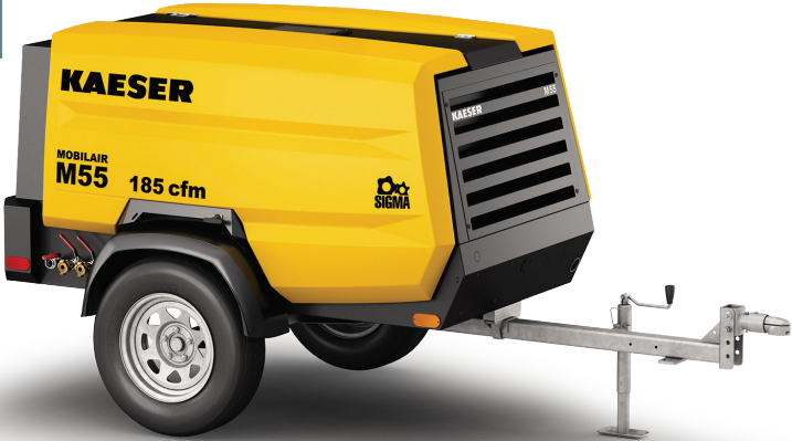
M55 diesel portable delivers 185 cfm

Available from 60 to 1700 cfm, our rugged MOBILAIR® units are built for heavy duty civil and commercial construction, demolition, and industrial back up.